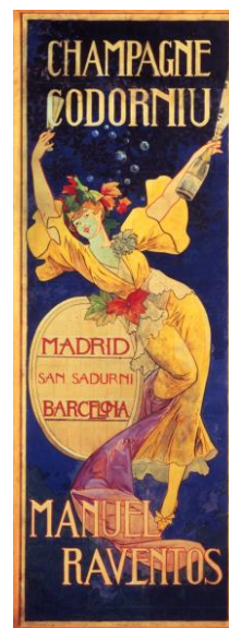
Images corresponding to a selection of the posters of the first contest, held in 1898.